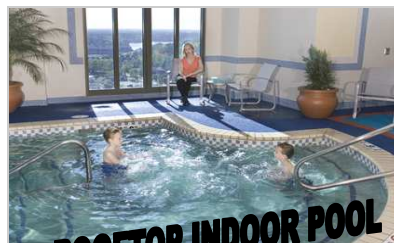
ROOFTOP INDOOR POOL