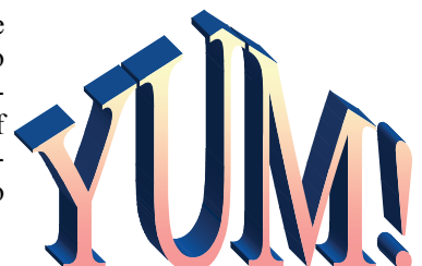
Sticky Banana Tart